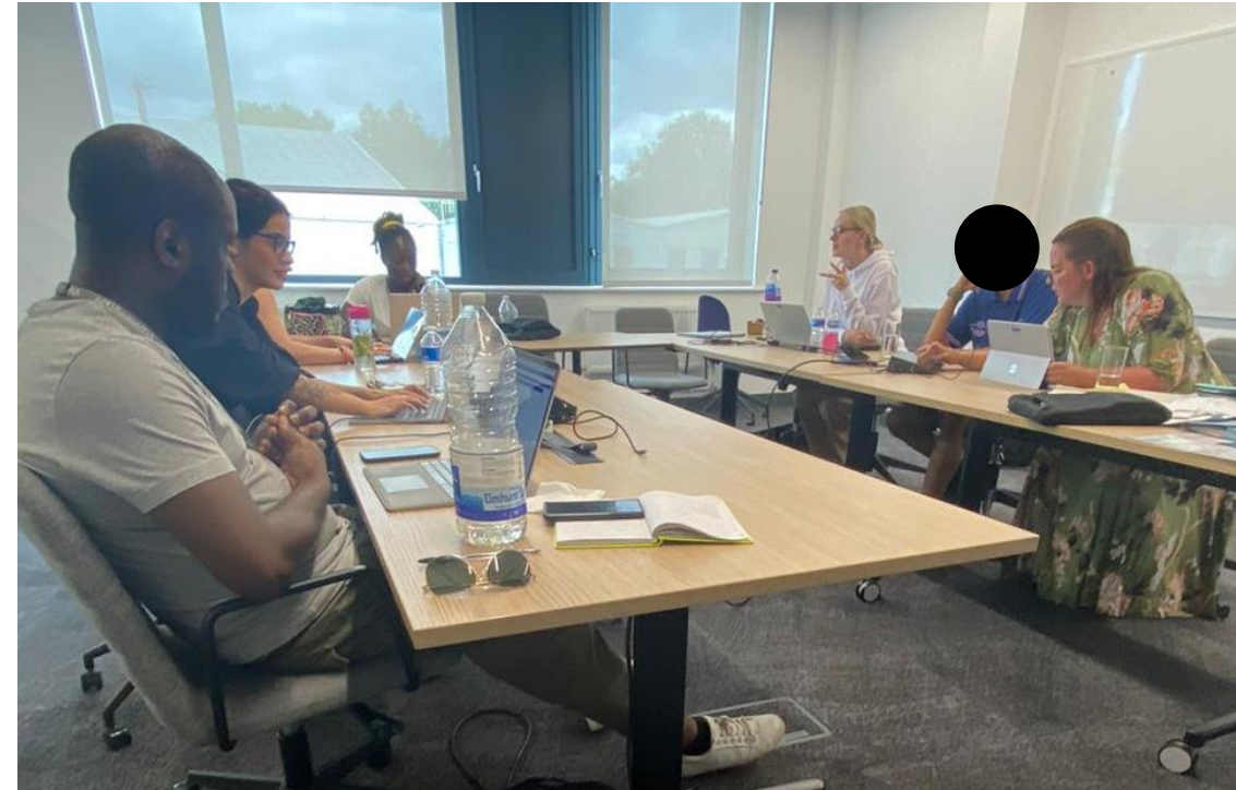
Newly-Qualified Social Workers attending training from experts by experience