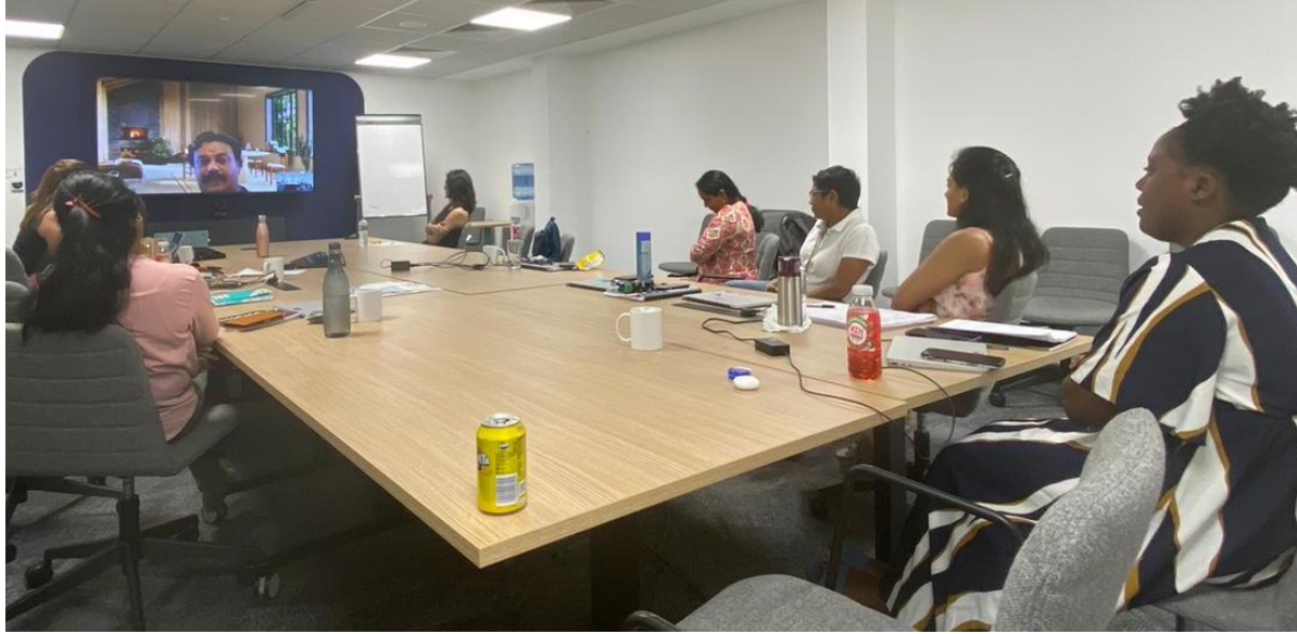
International Social Workers attending training from experts by experience